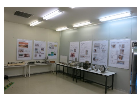
Mini tech museum 2