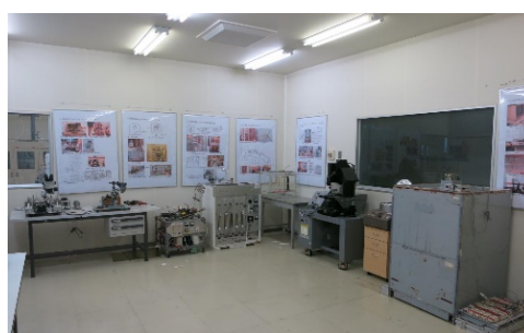
Mini tech museum 1