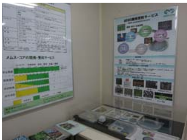
MEMS Core Co. Ltd. (Contract development of MEMS)