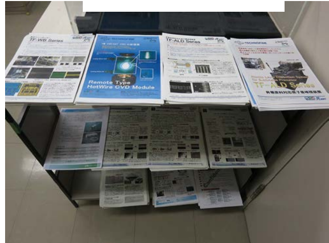
Commercialization of developed equipment (ALD, bonding, CATCVD)