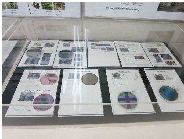
Each process steps in the wafer fabrication