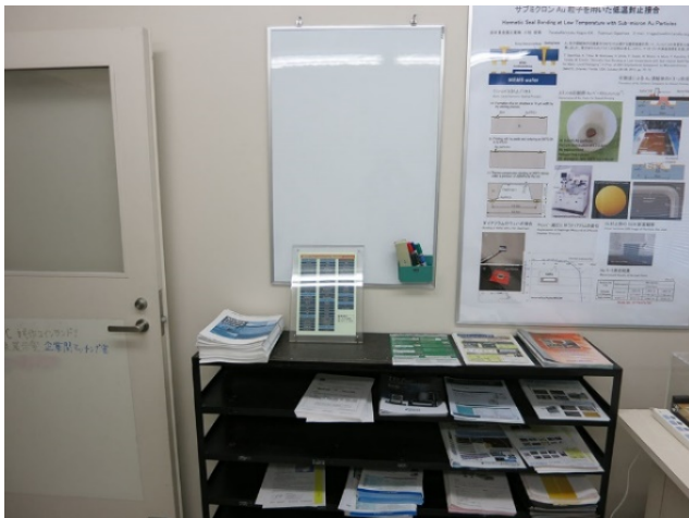
Catalogs of products for business matching