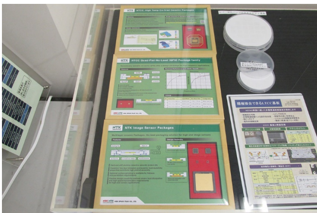
Samples for packaging (Tanaka Kikinzoku Kogyo, NGK, Nikko)