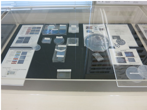
Nanoimprint, Sandblast, Water laser