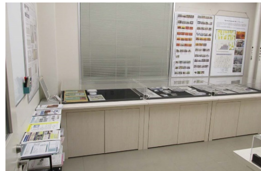
View from the entrance