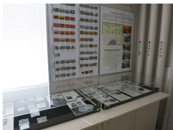
Hands-on access fab.