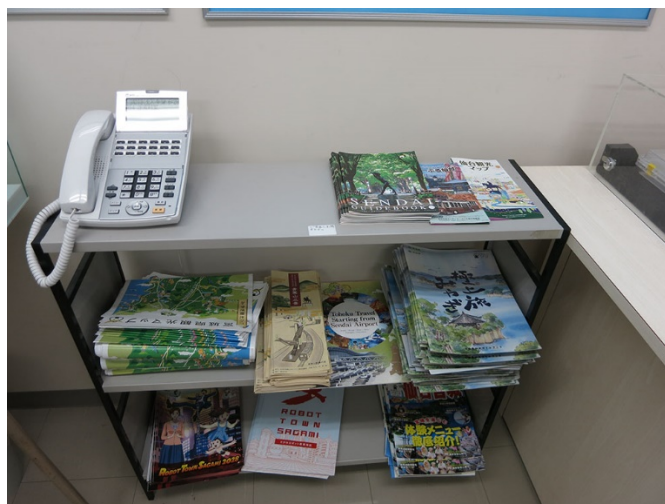
Sightseeing information of Sendai city