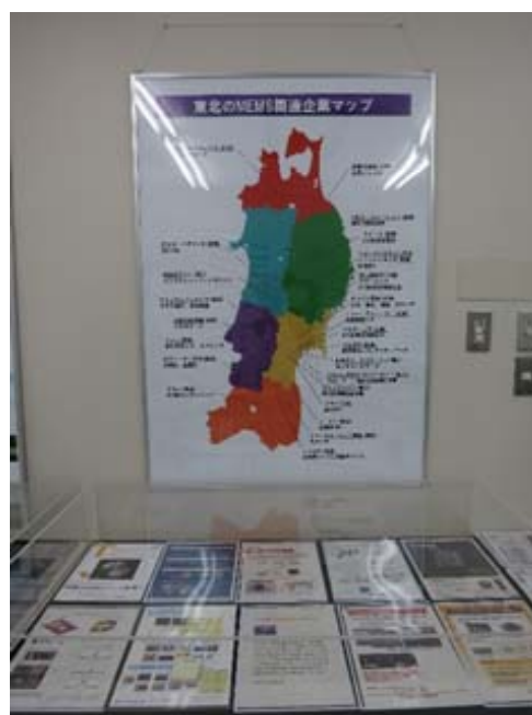
MEMS company map in Tohoku region