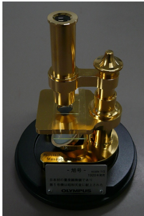
First microscope (replica) (Olympus)