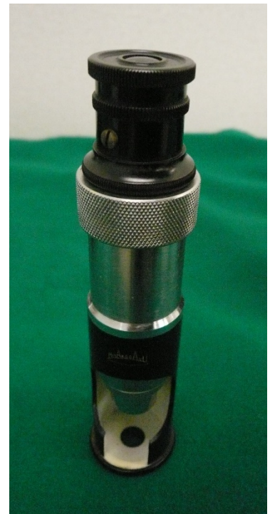
Portable microscope [1]