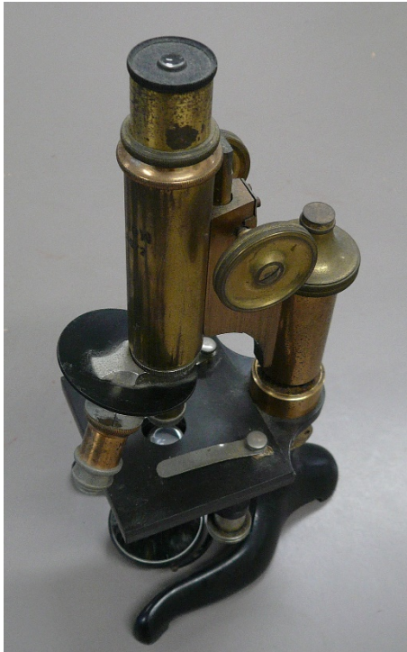
Old biological microscope