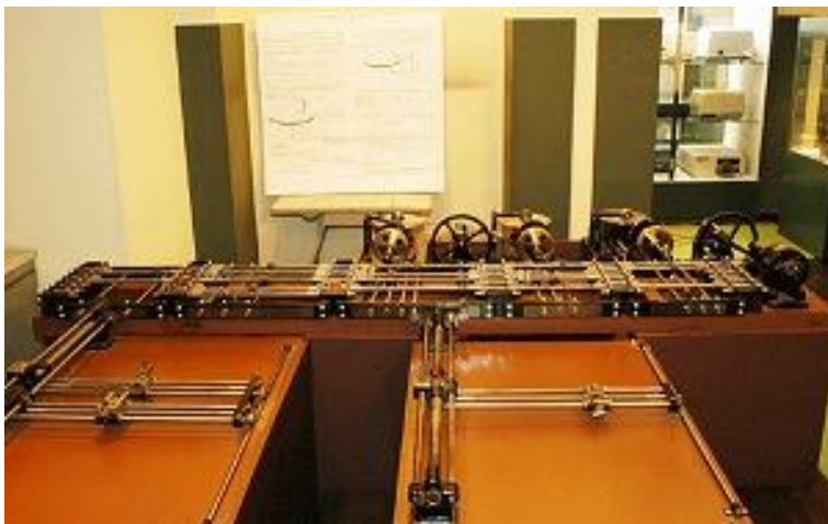
Differential Analyzer ( https://www.tus.ac.jp/info/setubi/museu )