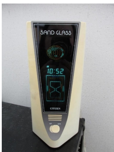
Graphic clock (1985 Citizen) [1]