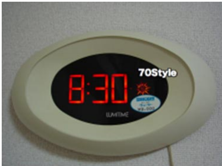
Mechanical discharge lamp display clock driven by AC motor (1970 Tamura) [1]