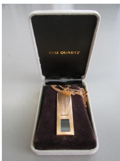
Pendant quartz watch (1979 Sharp) [1]