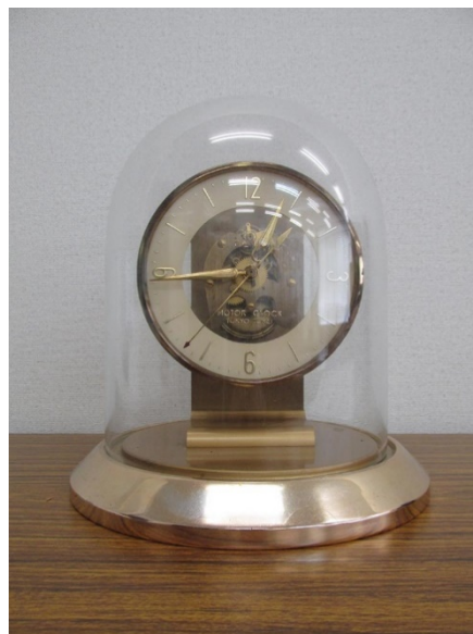
Clock driven by electrical motor (Tokyo clock) [1]