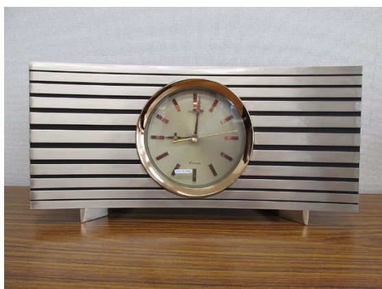
Tuning fork clock (1974 Seiko) [1]