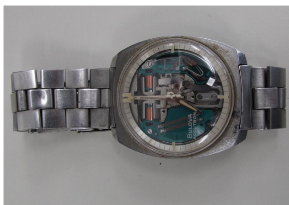
Tuning fork watch (1960 Bulova Accutron (Switzerland) [2]