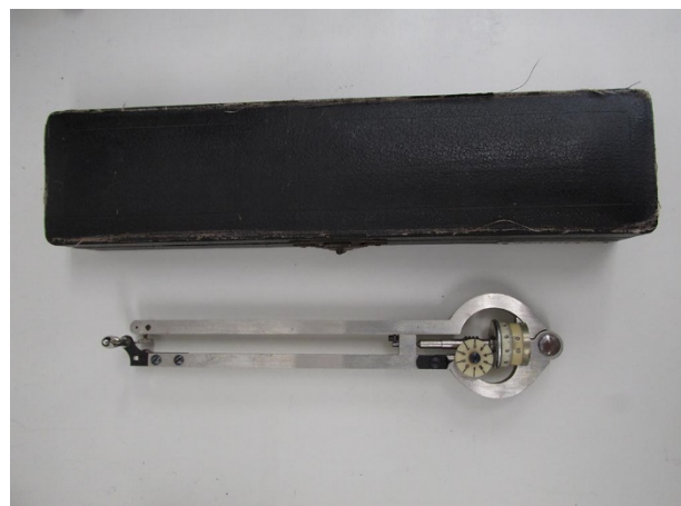
Planimeter (measurement of area)