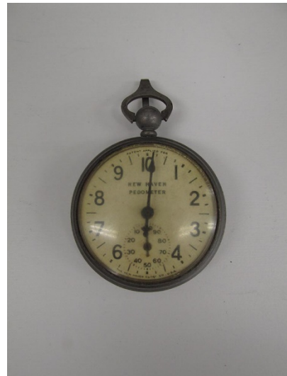
Pedometer (1930!' s USA) [1]

The weather is visible in the left glass tube. The liquid inside crystalize depending on the weather.