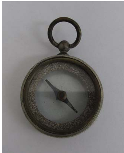
Portable magnetic compass [1]