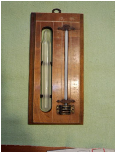
Fare and rain meter (around 1925) [1]