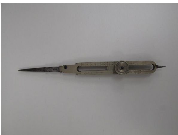
Proportional compass [1]

The weather is visible in the left glass tube. The liquid inside crystalize depending on the weather.