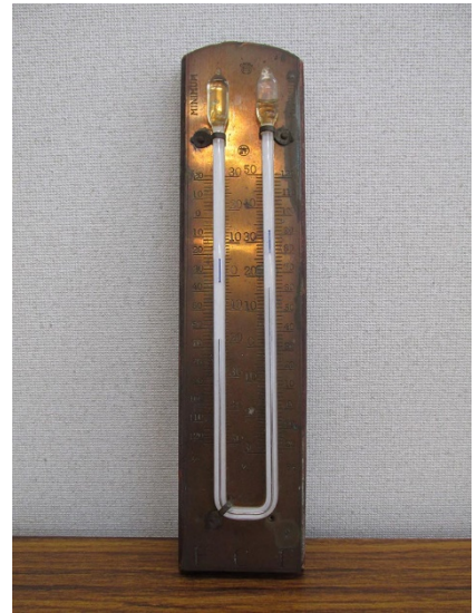
Maximum minimum thermometer [1]