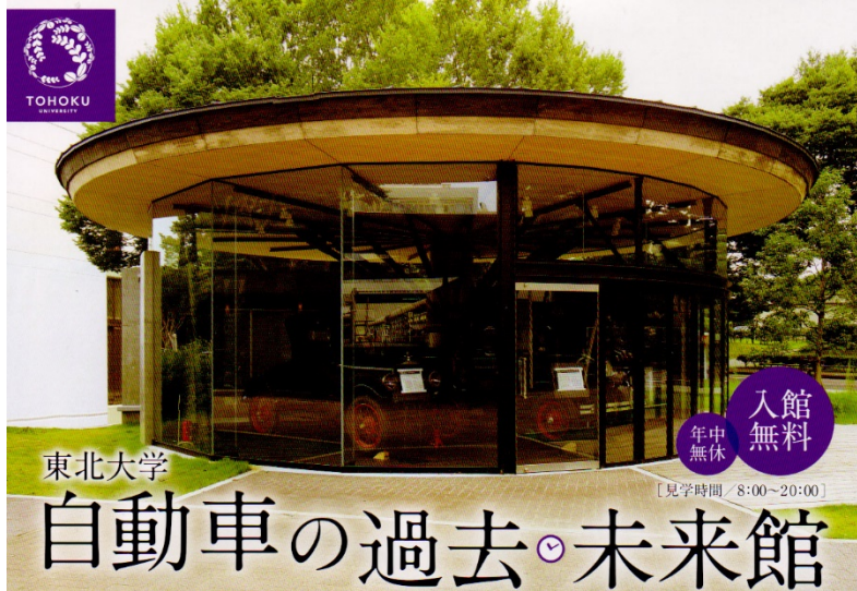
(Engineering School campus east end)