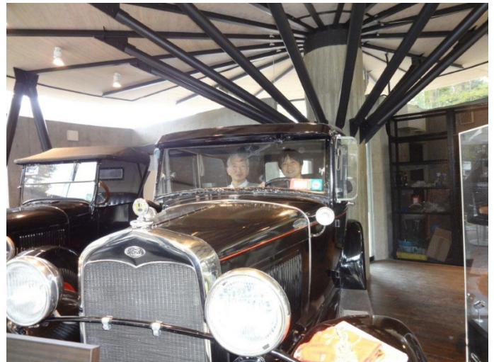
Model A Ford (1927–1931 4 million cars)