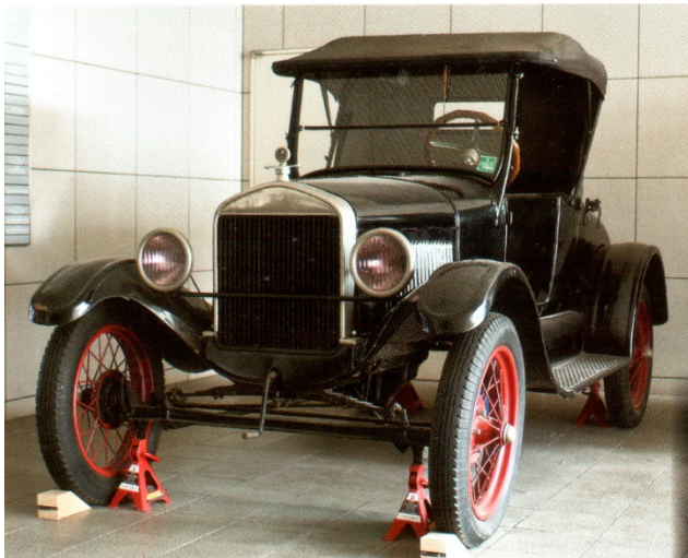
Model T Ford (1908–1927 15 million cars)