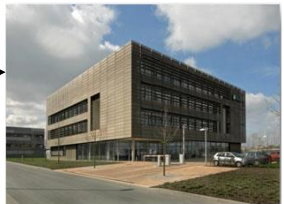
Fraunhofer ENAS (Electronic NANO System) located in the campus of Chemnitz institute of Technology