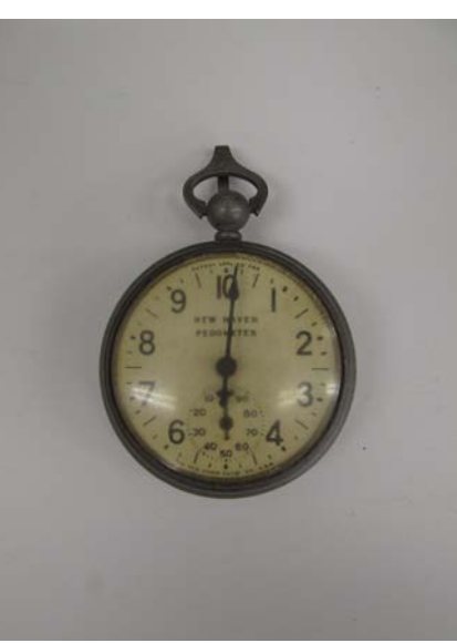
Pedometer (1930!'s USA) [1]