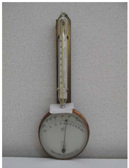
Hear hygrometer with thermometer [1]