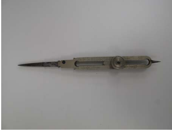
Proportional compass [1]