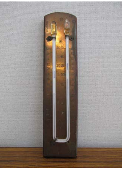
Maximum minimum thermometer [1]