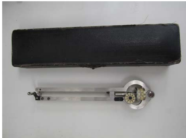
Planimeter (measurement of area)