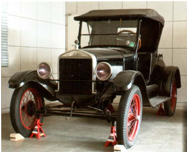
Model T Ford (1908-1927 15 million cars)