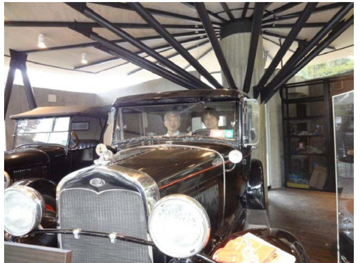
Model A Ford (1927-1931 4 million cars)