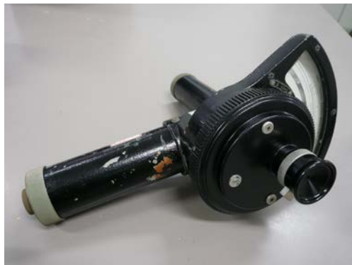
Radiation temperature meter using diminishing image of hot wire