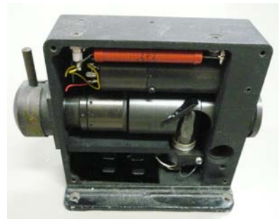
Golay cell (infrared light detector using an expansion of gas)