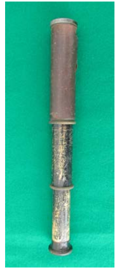
Old biological microscope First microscope (replica) Portable microscope [1] Telescope (1930s)[1] (Olympus)