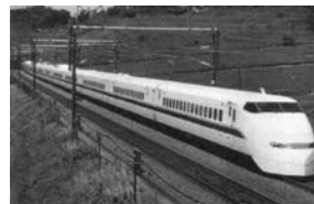
Model 300 (1992~) and Model 500 GTO + PWM control electric power regeneration brake