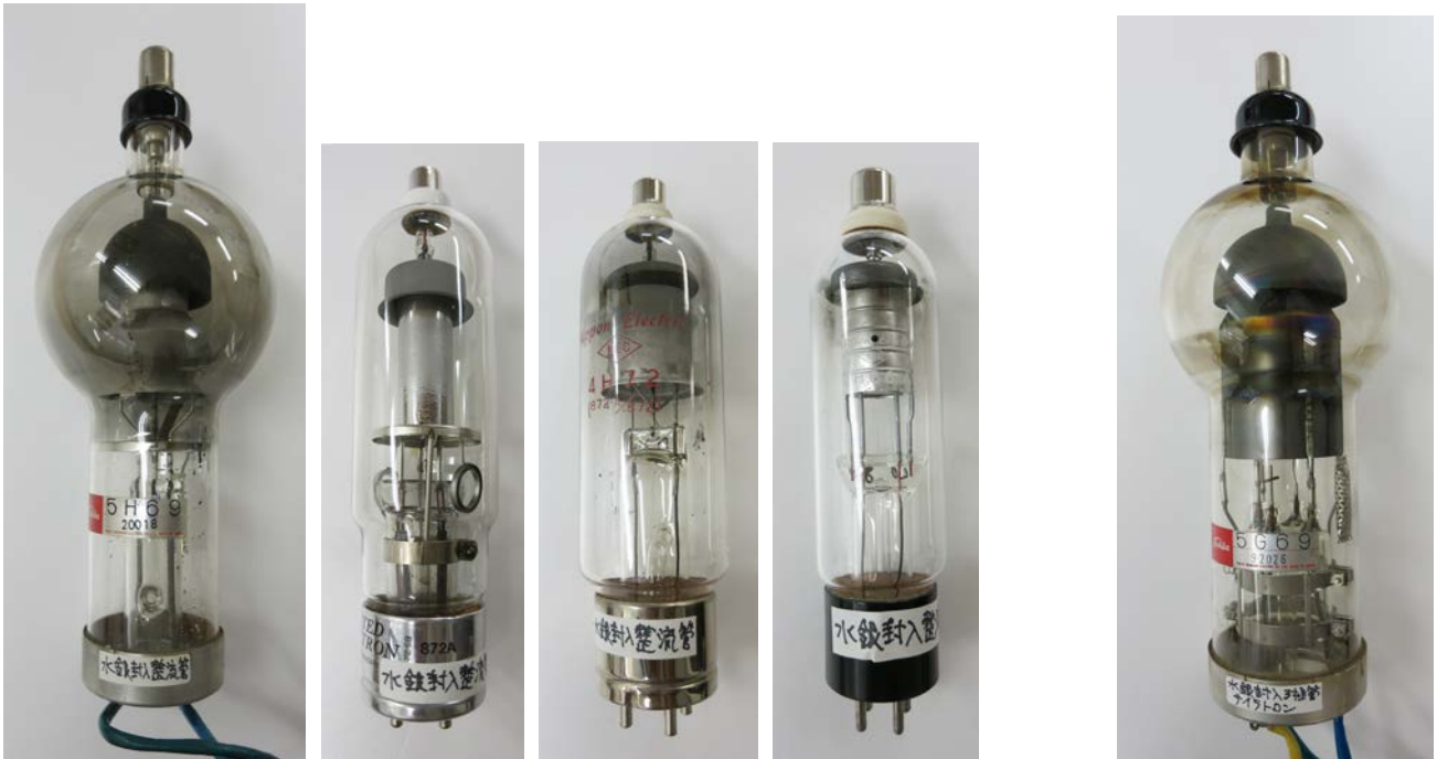
Mercury rectifier 5H69 872A 4H72 2H66 Thyatron(power control) (5G69)