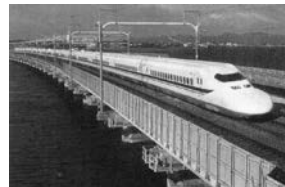
Model 700 (1998~) IGBT Inverter