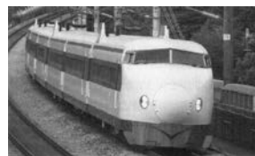
Model 0系 (1964~) ダイオード + 変圧器 端子切り替え