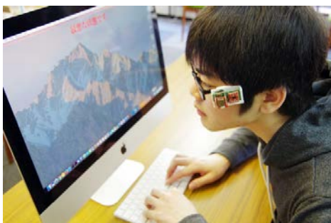
Self neck corrector (Tohoku Univ., Natural science) (Winner iCAN' 17)