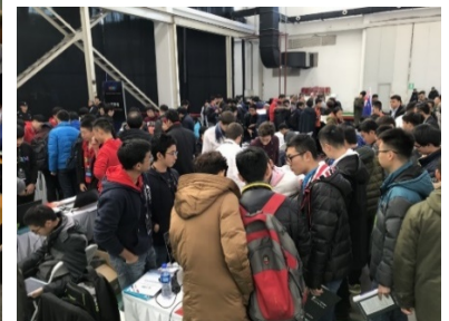
Demonstration by students in iCAN' 17 (Beijing)