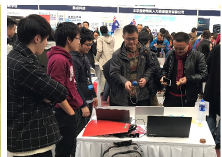
Super Kendama Brothers (Tohoku Univ.)