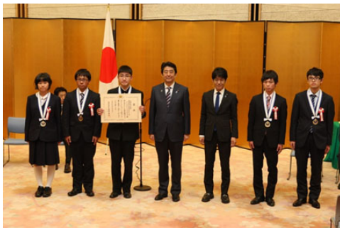
Home security robot (Kohriyama North Technology High school) Prime minister Award, (Winner iCAN' 14)