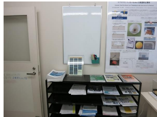
B. Catalogs of products for business matching