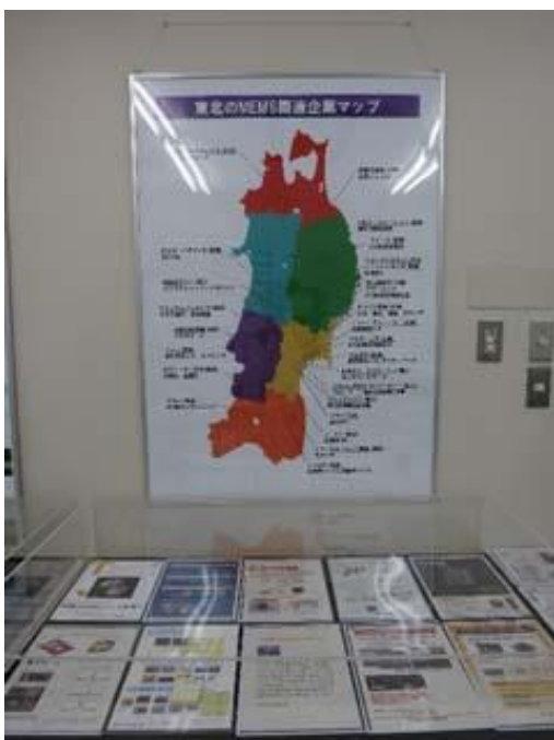
K. MEMS company map in Tohoku region