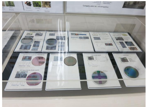
F. Each process steps in the wafer fabrication