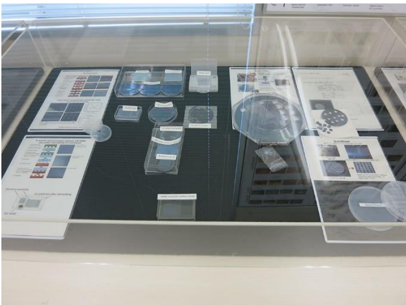
E. Nanoimprint, Sandblast, Water laser