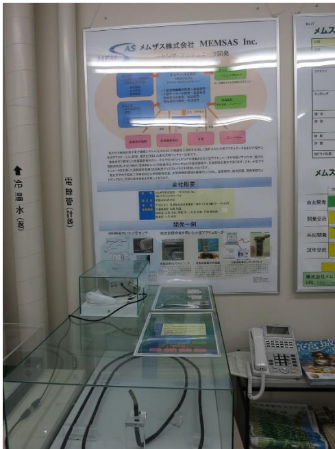
G. MEMSAS Ltd. (Minimal invasive medicine)