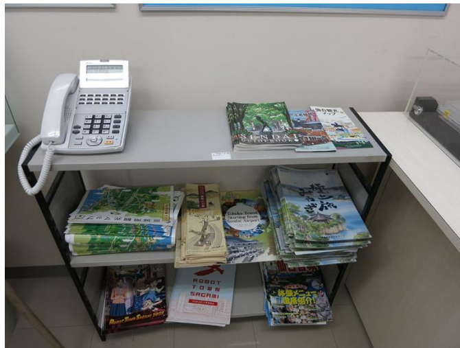
H. Sightseeing information of Sendai city