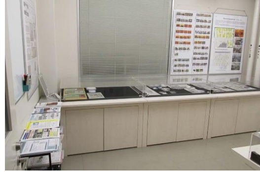
A. View from the entrance