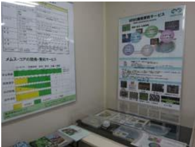
I. MEMS Core Co. Ltd. (Contract development of MEMS)