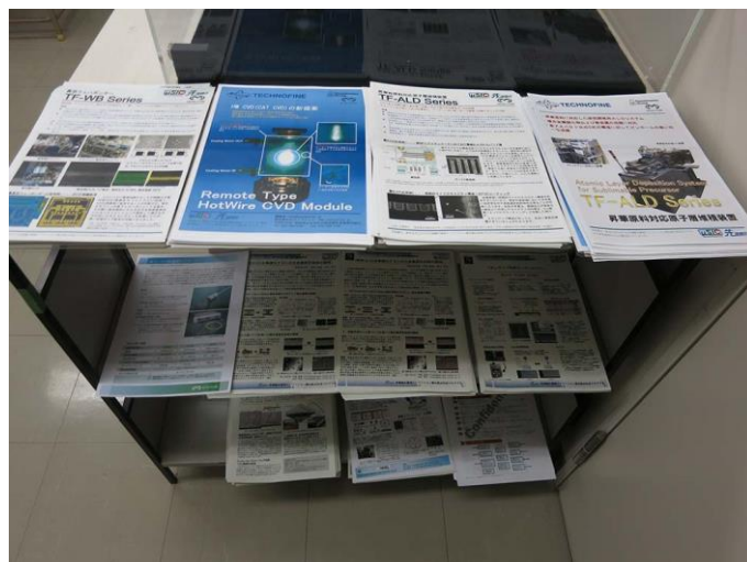
L. Commercialization of developed equipment (ALD, bonding, CATCVD)