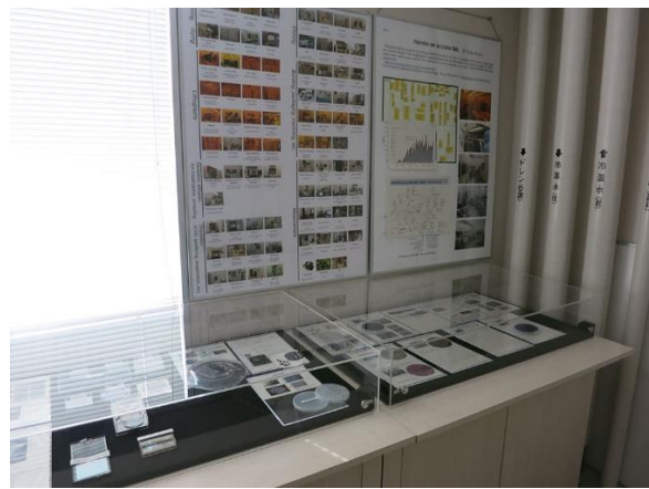
D. Hands-on access fab.