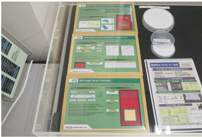
C. Samples for packaging (Tanaka Kikinzoku Kogyo, NGK, Nikko)